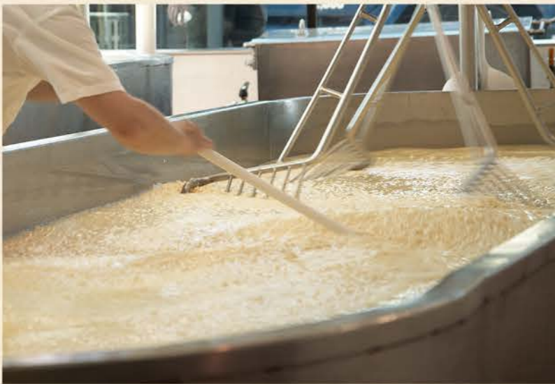
A cheesemaker stirs the curds and whey in Pike Place Market.

By starting with fresh, pure milk from local farms and applying the traditional methods used by cheesemakers for thousands of years, Beecher's cheeses are free of artificial ingredients making them just as delicious as the milk they are made from.